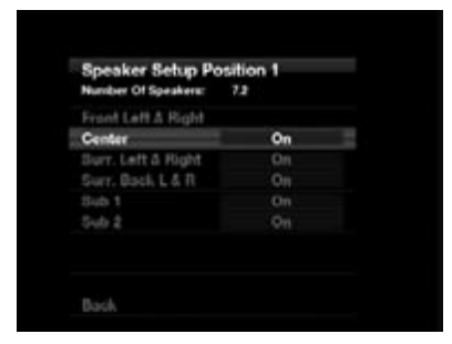
Figure 29 – Number of Speakers Menu

Move the cursor to the Number of Speakers line and press the OK Button. See Figure 29.